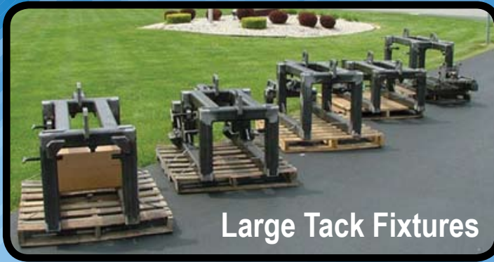
Large Tack Fixtures