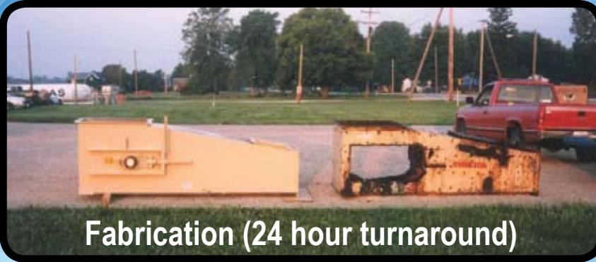
Fabrication (24 hour turnaround)